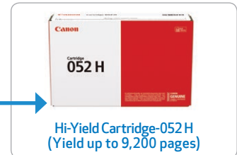
Hi-Yield Cartridge-052 H (Yield up to 9,200 pages)

Use of Canon GENUINE toner cartridges helps provide longer equipment life, high yields, reliable performance, high-quality output, and minimal jamming or issues.