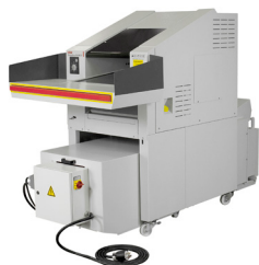
Powerline SP 5080