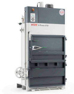
V Press 610