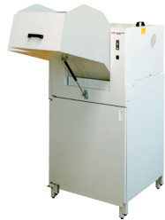
PET Crusher 1049 SA Bottle & Can Crusher