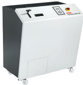
HDS 150 Hard Drive Shredder

The HSM Powerline hard drive shredders destroy digital and magnetic media (i.e. USB sticks, magnetic tapes, CDs, DVDs and Blu-ray discs, enterprise drives, credit cards, loyalty cards and disks) into tiny particles making recovery practically impossible. Safe and efficient to use, data protection compliant.