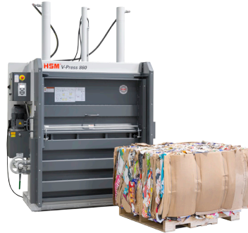
V Press 860 plus B