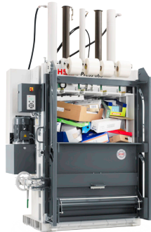
V Press 860