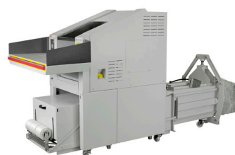
Powerline SP 5088