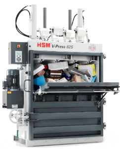
V Press 825