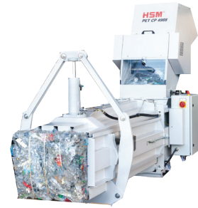
PET Crusher CP4988 Bottle & Can Crusher w/Horizontal Baler