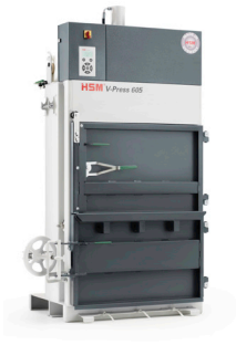
V Press 605

Due to their size, cost efficiency and capacity, HSM's vertical baling presses of the V-Press series are incredibly well-suited for industry, manufacturers and trading alike. With this compact baling press, you can reduce the volume of your on-site packaging material by up to 95%.