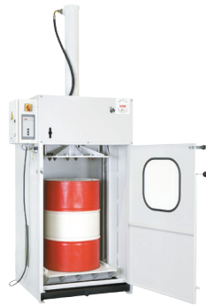
FP 3000 Barrel Press

The HSM Barrel Crusher is equipped with a pressing power of 27.5 tons and is well suited for pressing light metal and rolled hoop drums. HSM PET Bottle & Can crushers & crusher/ballers puts a cap on crowded warehouse & waste management areas by disposing and crushing between 2,400 - 4,800 plastic bottles and aluminum cans per hour.