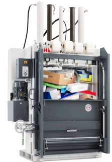
V Press 1160