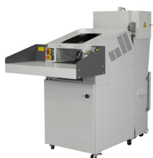
Powerline SP 4040