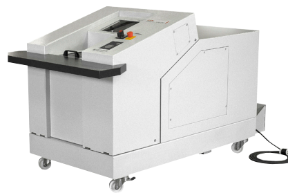
HDS 230 Hard Drive Shredder