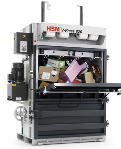
V Press 820 plus